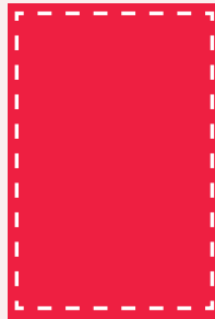
FULL BLEED 8.75" w x 11.25" h (TRIM: 8.5" w x 11" h)