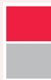
HALF 7.5" w x 4.75" h