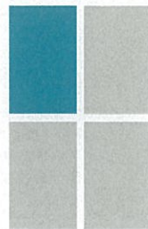
QUARTER 2.625" w x 4.125" h