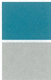
HALF 5.5" w x 4.125" h